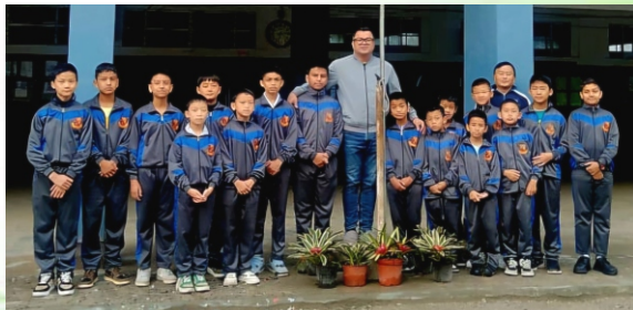
Flag Hoisting in the School by the Headmaster and Hostellers