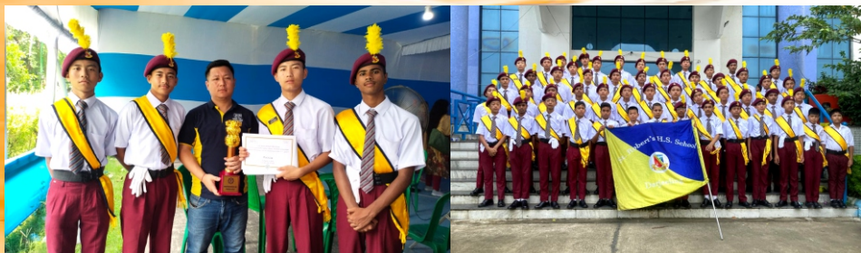
Marching Contingent at Red Road, Kolkata