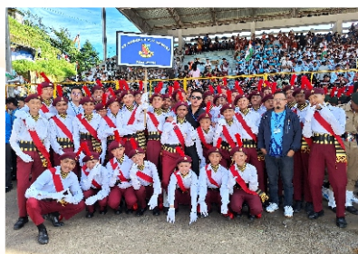
Marching Contingent at Gorkha Stadium, Lebong